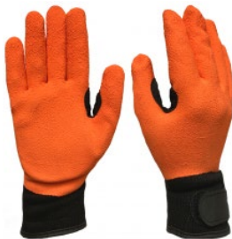
Glove model F304N Antineedle 5

EN 420 : 2003:+A1:2009 & Dexterity 5 EN 388:2016 (3X44F) ANSI-105:2016 Level 5