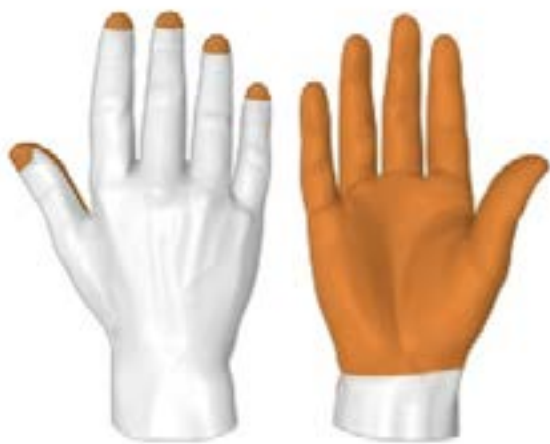
Puncture protection area