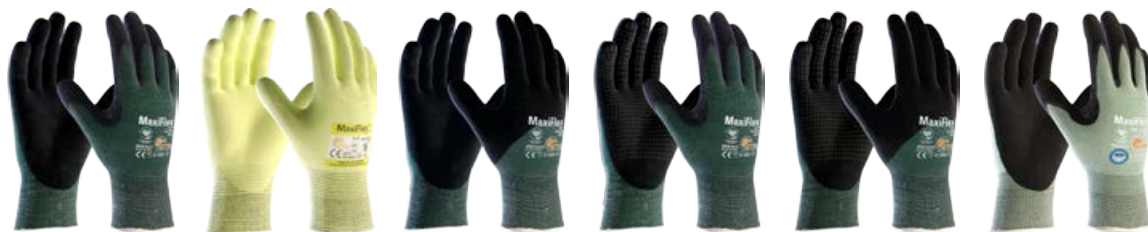
34-8743 34-8743FY 34-8753 34-8443 34-8453 34-6743