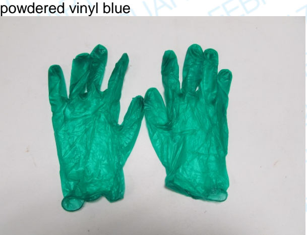
Samples of gloves described as Industrial powdered vinyl green