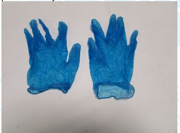
Samples of gloves described as Industrial powder free vinyl blue