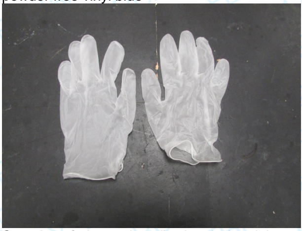
Samples of gloves described as Industrial powder free vinyl clear