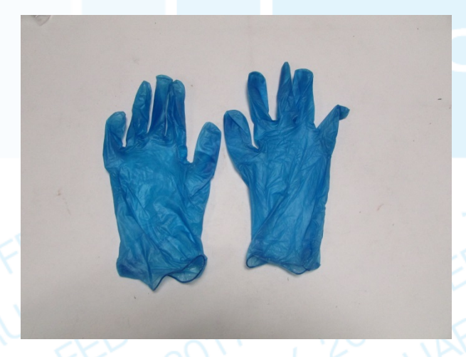
Samples of gloves described as Industrial powdered vinyl blue