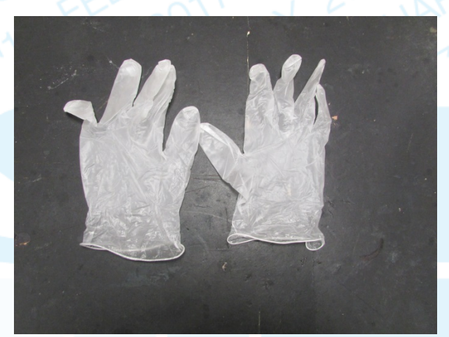
Samples of gloves described as Medical powdered vinyl clear