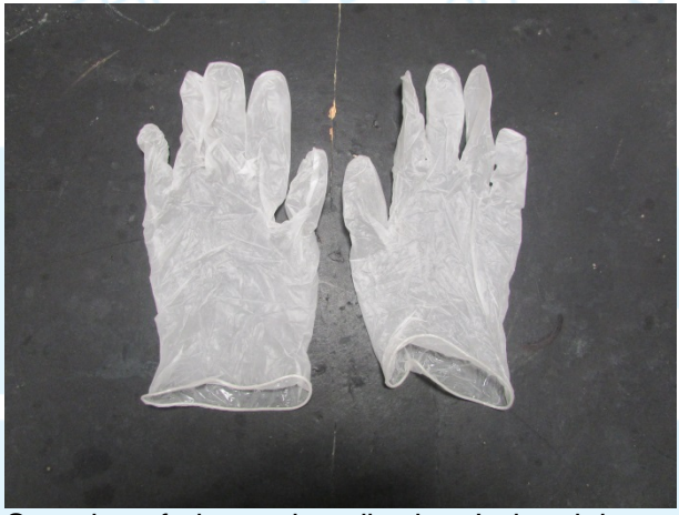
Samples of gloves described as Industrial powdered vinyl clear