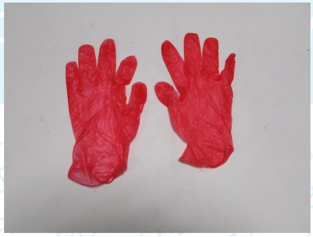
Samples of gloves described as Industrial powdered vinyl red