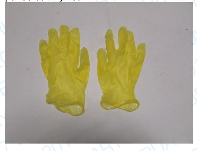
Samples of gloves described as Industrial powdered vinyl yellow